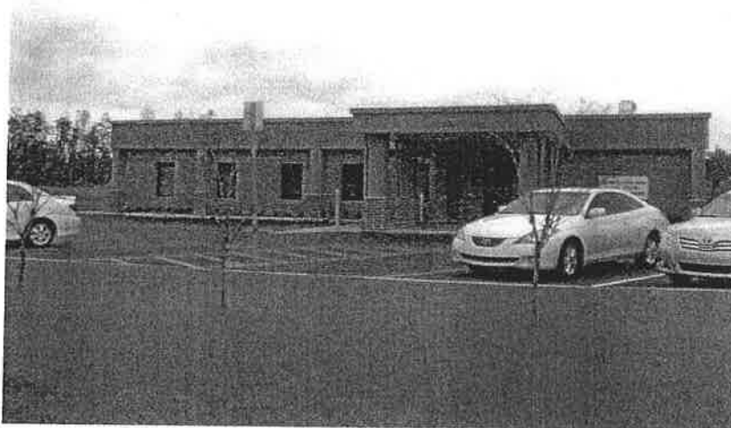
11/30/09 FRONT VIEW